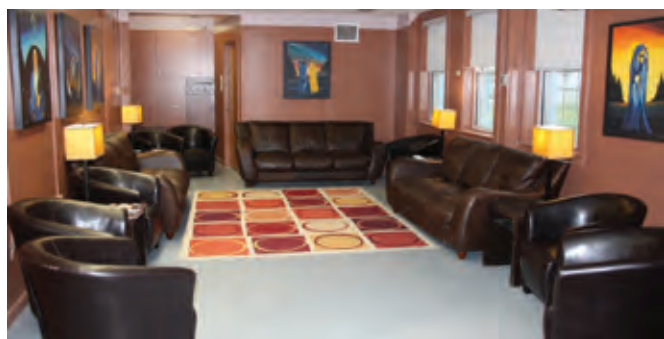
WGH, Traditional Healing Room

Peawanuck Nursing Station (705) 473-2525