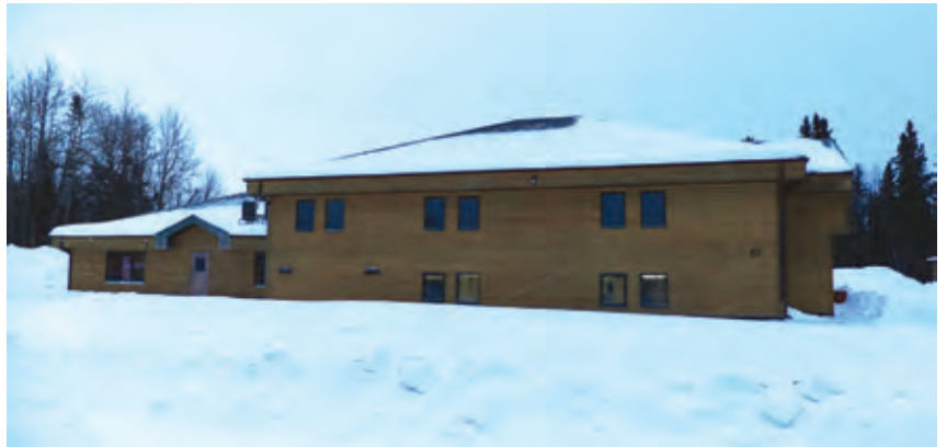
MoCreebec Council of the Cree Nation

Housing Director (705) 658-4769, ext. 2007