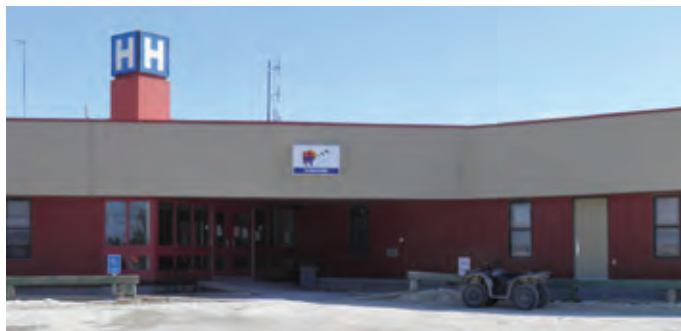
WAHA, Fort Albany Hospital