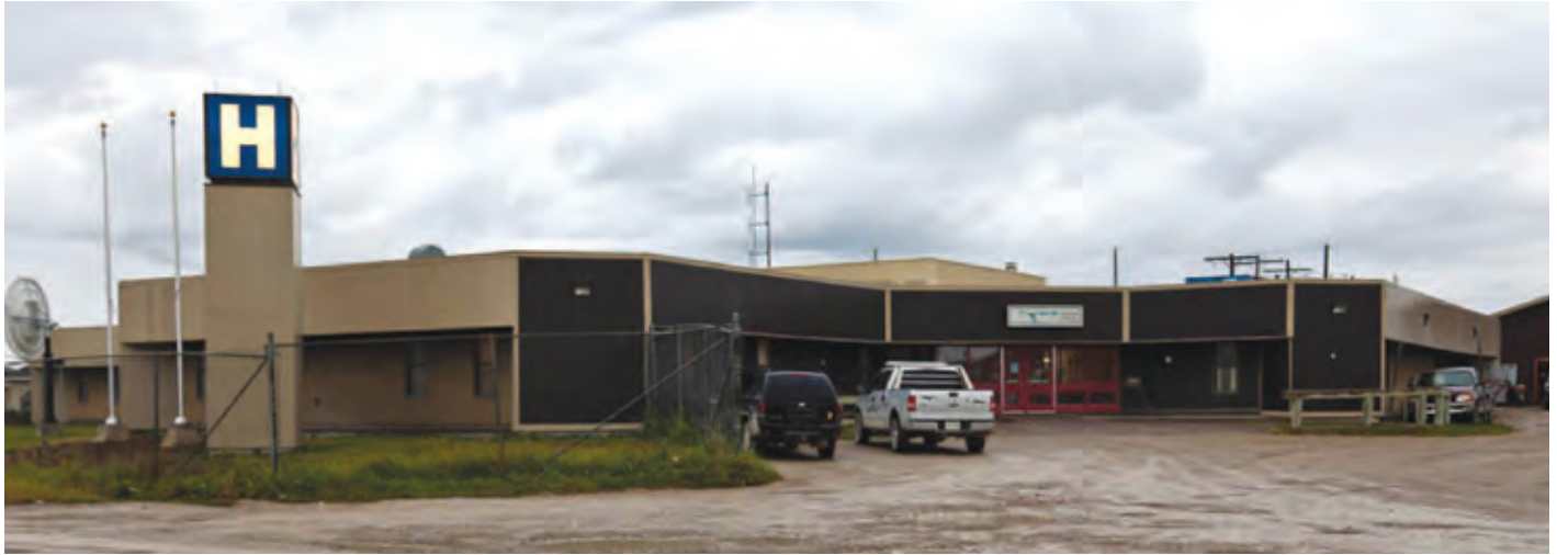
WAHA, Attawapiskat Hospital