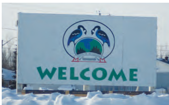
Town of Moosonee