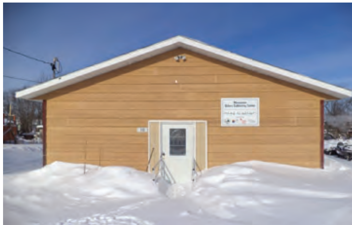
Elder's Gathering Centre, Moosonee