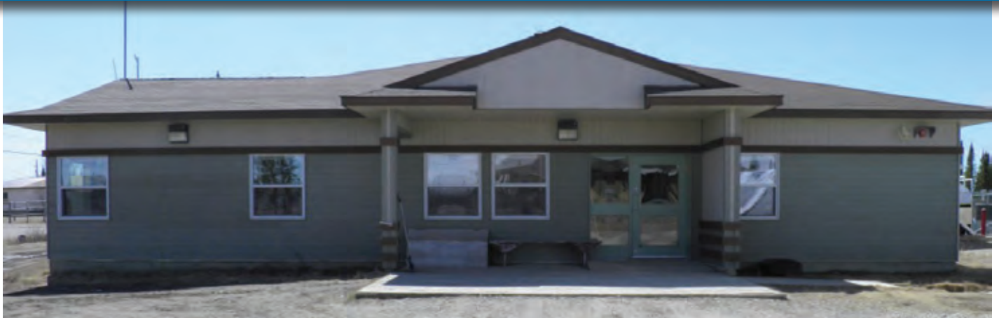
Peawanuck Nursing Station