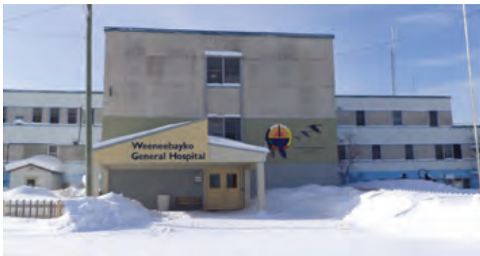
Weeneebayko General Hospital, Moose Factory