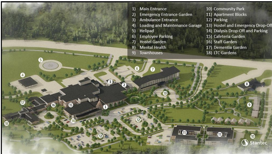
Figure 2 Aerial view of new hospital in Moosonee, ON