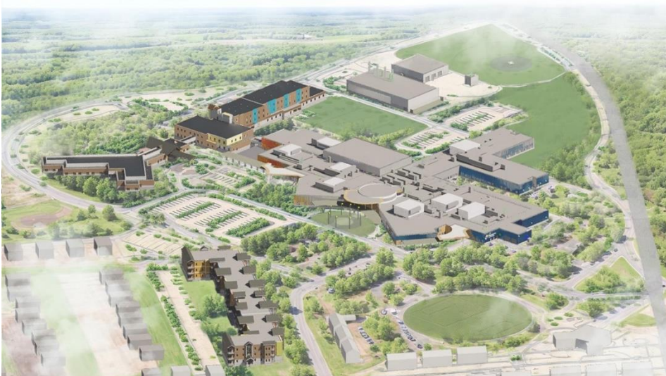
Figure 1 Aerial view of new regional healthcare campus in Moosonee, ON